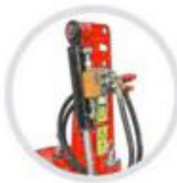
Reliable Turnover Mechanism & Multi Angle Adjustment