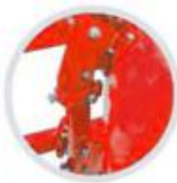
Adjustment for Working Depth