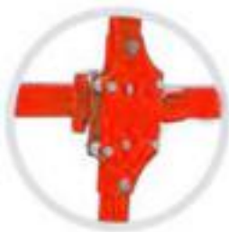
Over Load Security