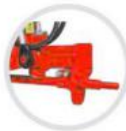
Side Adjustment Table Drawer