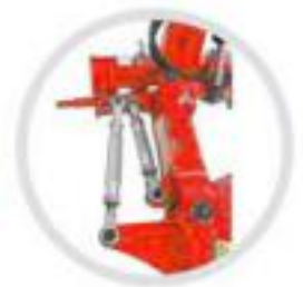
Sidelink Quick Adjustment Setting

Mould Board Plough - Reversible Hydraulic (With Sidelink Quick Settings - Economy)